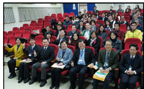
Sixty-five Members of the Taiwan Association for Food Protection attended the 2016 Annual Meeting on February 26.