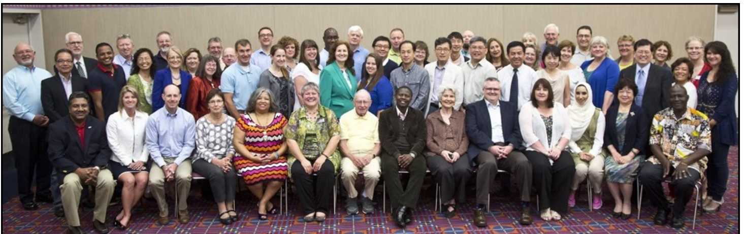
IAFP 2015 Affiliate Council Delegates and Representatives

*Delegate is currently not an IAFP Member, as of April 15, 2016 (a requirement under IAFP Bylaws).